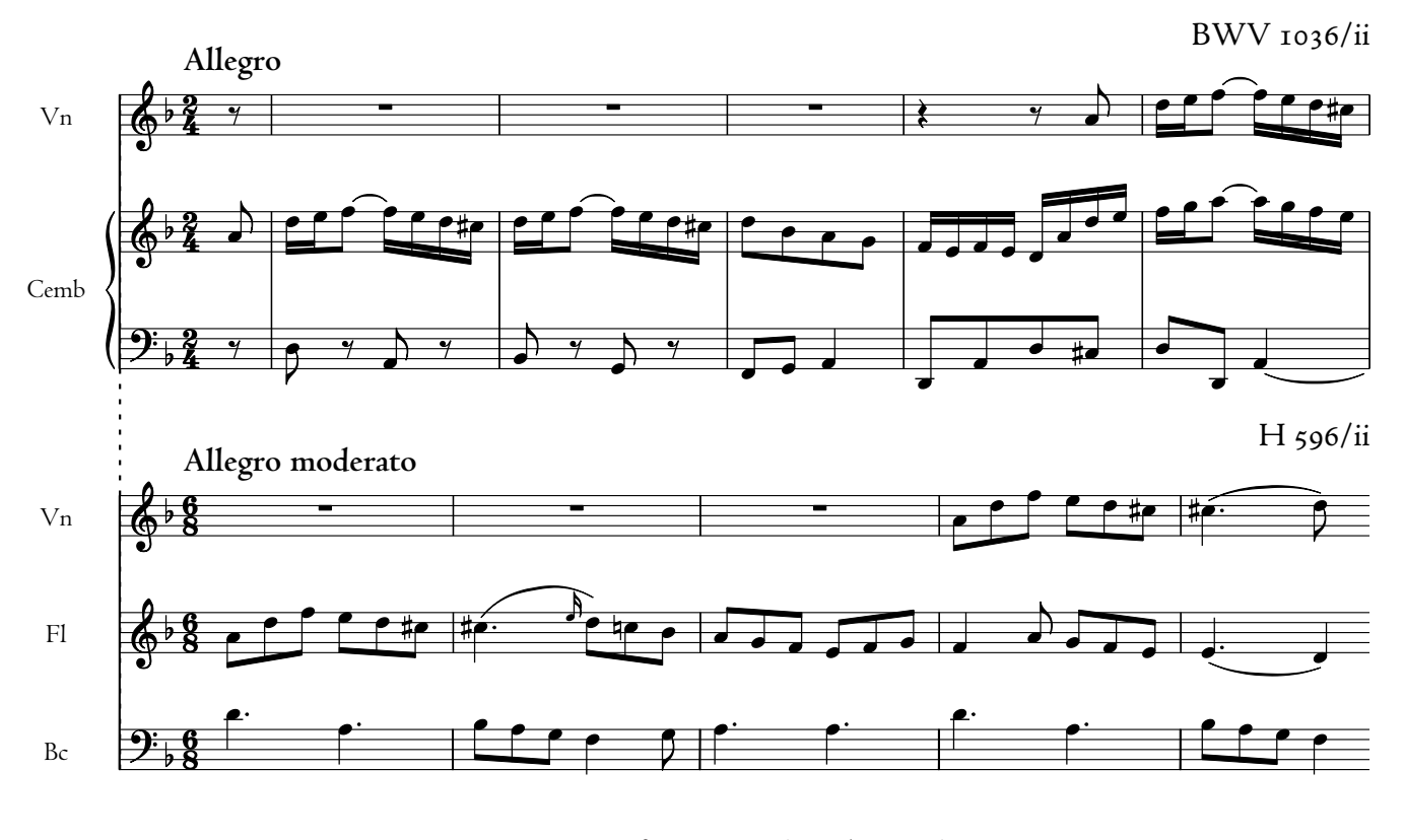
EXAMPLE 3. Comparison of BWV 1036/ii and H 596/ii, mm. 1–5