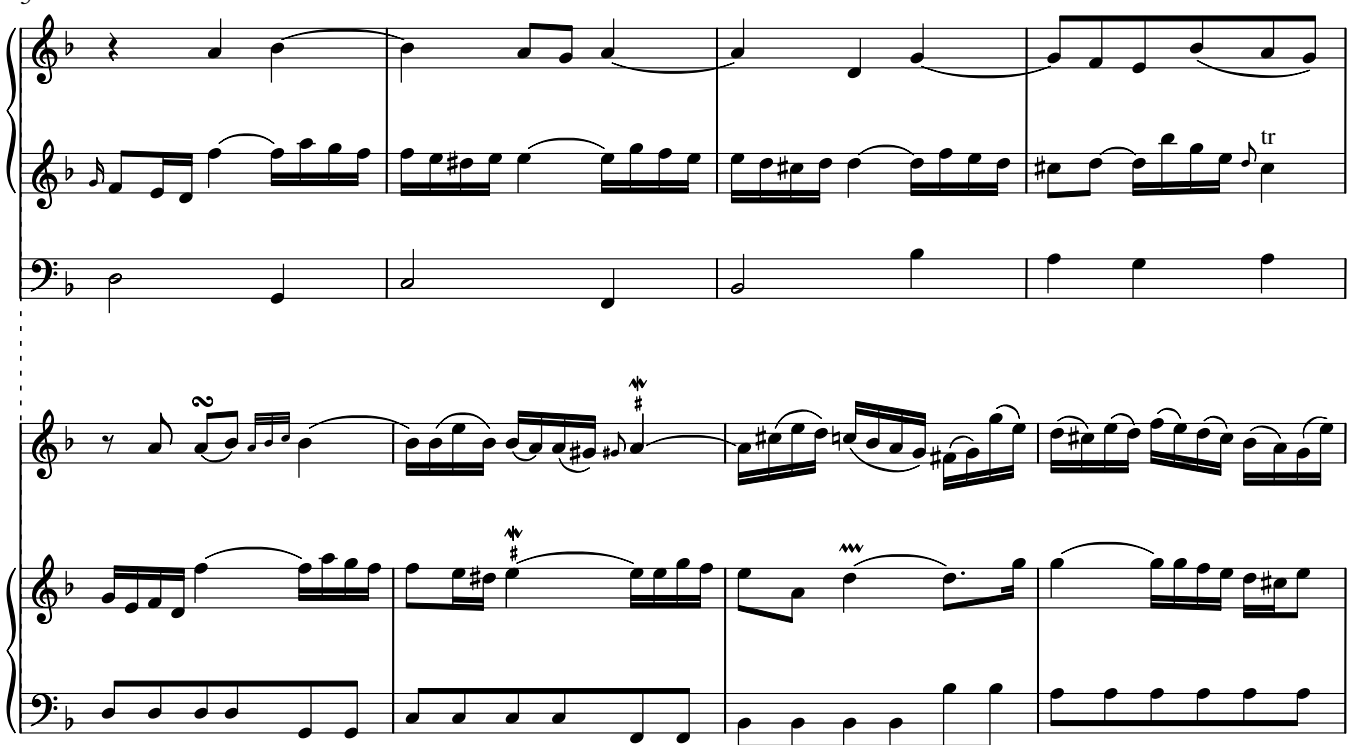
EXAMPLE 2. Comparison of H 352 and Wq 72/i, mm. I–8 \,